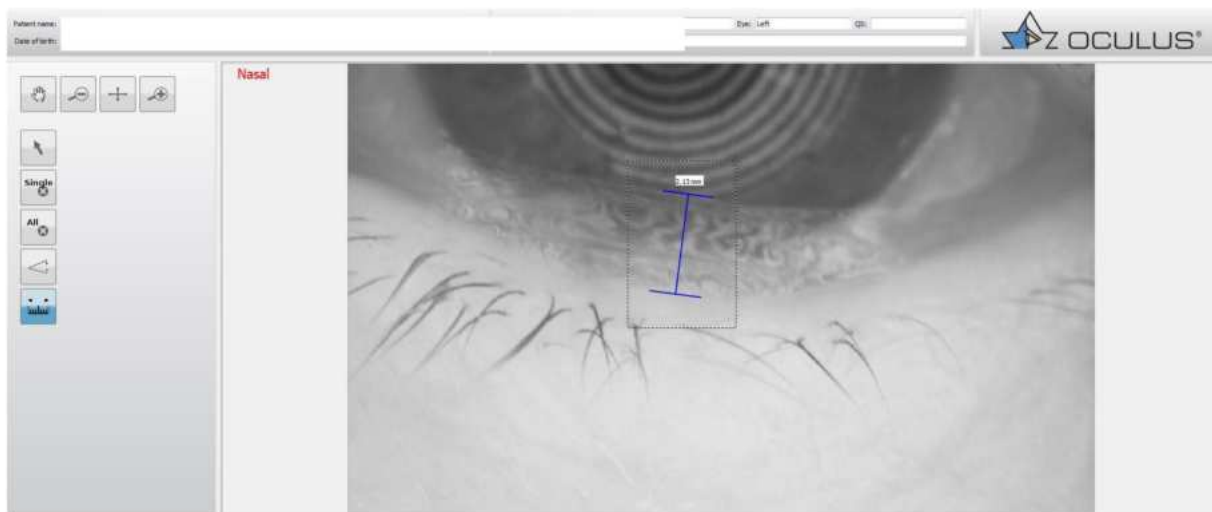
Figure 4. Tear meniscus height measurement artifact due to the presence of conjunctivochalasis. Image obtained with Keratograph5 M (Oculus Optikgeräte GmbH, Wetzlar, Germany).

Nevertheless, there are some drawbacks to these new diagnostic techniques that need to be mentioned. In particular, the cost may represent a major limitation for their widespread acceptance, and cost-effectiveness evaluations are still required to support their adoption on a large scale. Moreover, ophthalmological conditions other than DED may cause some phenomena that reduce the diagnostic accuracy, particularly if the image interpretations are not performed by an ophthalmologist and/or if the slit lamp examination is not performed. For instance, conjunctivochalasis may hamper the accurate measurement of TMH, leading to overestimation of the value (Figure 4), while conjunctival lesions, such as pterygium, may significantly alter bulbar redness by increasing its value in the affected area (Figure 5). It should also be noted that novel tests cannot yet replace all the traditional DED metrics and slit lamp examination is still required to complete the diagnostic workup.