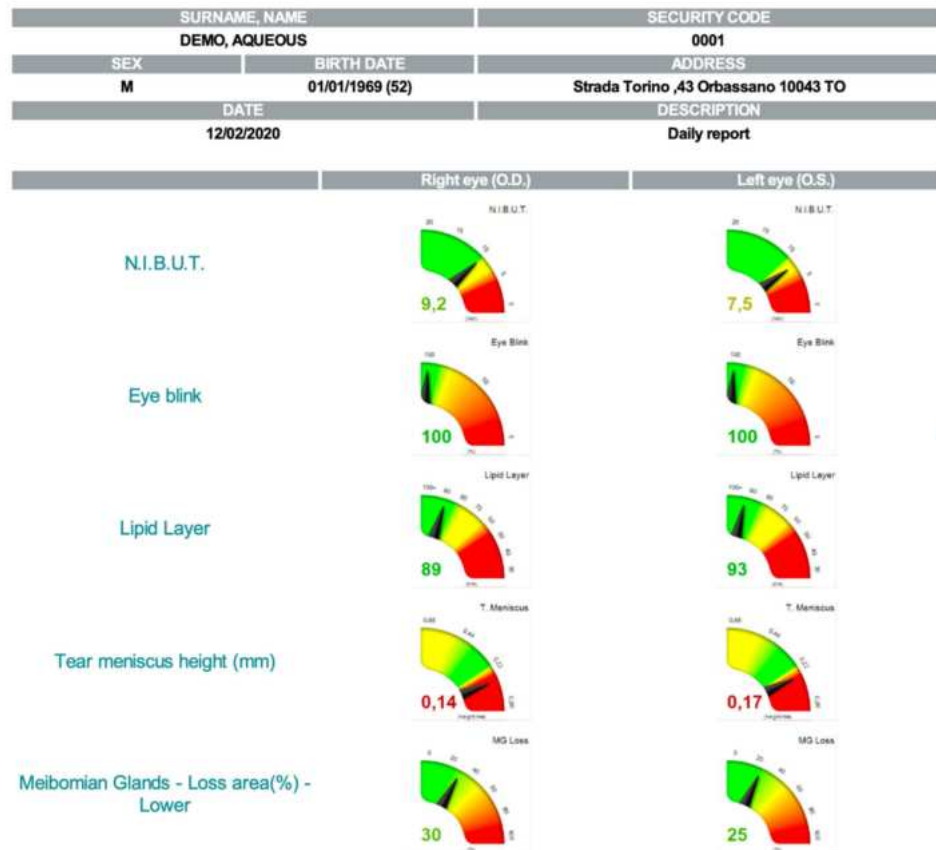
Figure 2. Dry Eye report obtained with the use of IDRA (Sbm Sistemi, Inc., Torino, Italy), including non-invasive break-up time, eye blink, lipid layer, tear meniscus height, and loss area of meibomian glands.