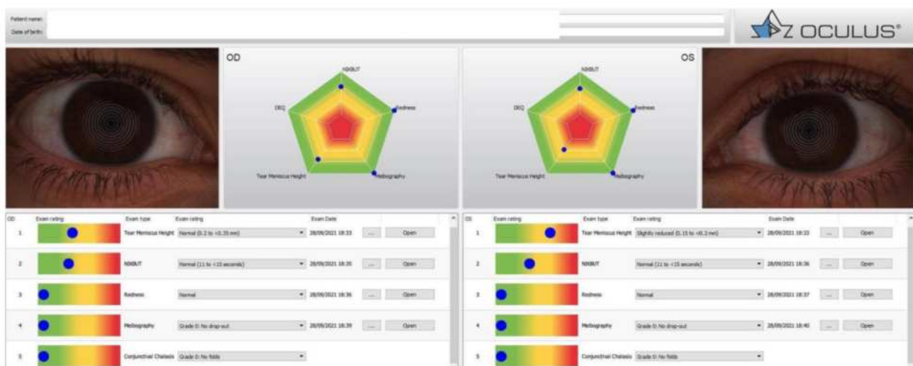
Figure 1. Dry eye report obtained with the use of Keratograph 5 M (Oculus Optikgeräte GmbH, Wetzlar, Germany). A combination of five parameters, including tear meniscus height, non-invasive break-up time, redness, meibography, and conjunctival chalasis, is displayed on a radar chart in a pentagonal shape.

The novel non-invasive diagnostic techniques for DED offer numerous advantages over conventional tests. The main advantage is related to their automated nature, which means that they do not require the clinician's judgment to determine a score. This is clinically relevant as subjective DED markers, such as fluorescein BUT and corneal staining, feature low inter-observer repeatability due to their lack of standardization [4]. Moreover, most of these novel diagnostic techniques do not require direct contact with the eye, and therefore have little/no effect on the volume and properties of the tear film. Thus, they can be used as screening tools (e.g., prior to ocular surgery) by trained medical personnel (not necessarily an ophthalmologist), before proceeding with more invasive ocular surface examinations in case of the detection of abnormal values. Furthermore, they provide clear and detailed reports summarizing all the results of the tests for each patient examination, which can be used for future reference and comparison (Figures 1 and 2).